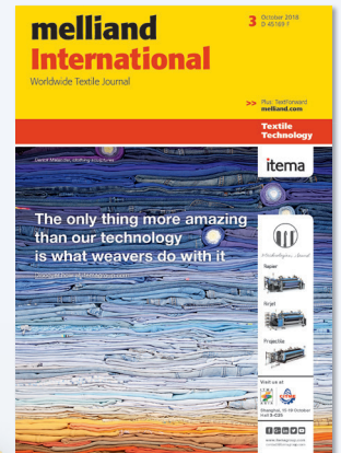
10,420 copies English, 4 issues p. a.