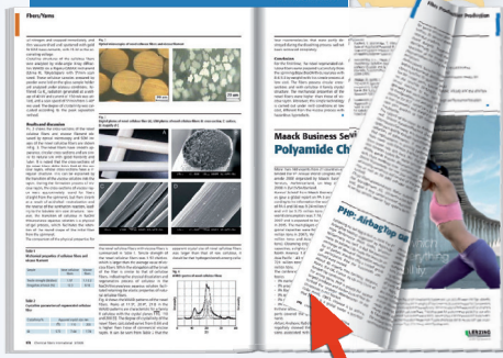
Online Magazine www.chemical-fibers.com