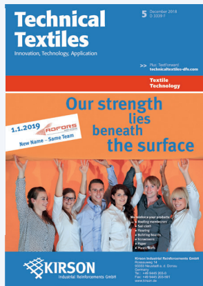
4,613 copies German/English, 5 issues p. a.