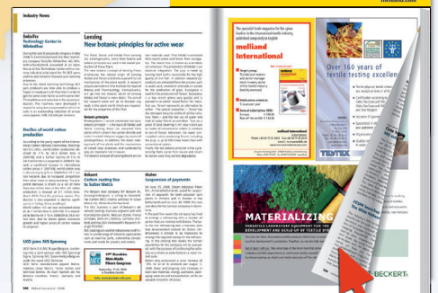
Online Magazine www.melliand.com