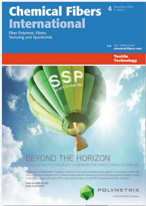
4,800 copies English, 4 issues p. a.