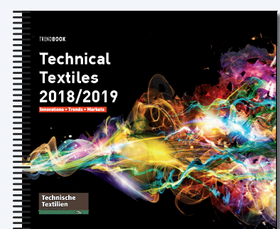
TRENDBOOK Technical Textiles 2018/2019 Innovations, Trends, Markets Start up the future with Technical Textiles with the 4 leading themes: Production • Mobility • Life • Re-Vision