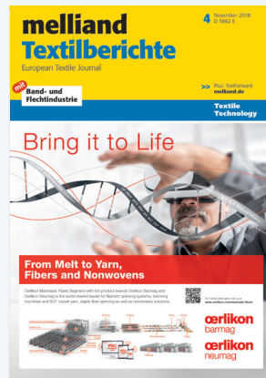
3,835 copies German, 4 issues p. a.