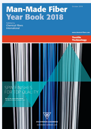
4,800 copies English, 1 issue p. a.