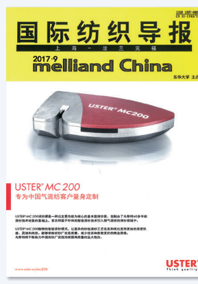
7,000 copies Chinese, 12 issues p. a.